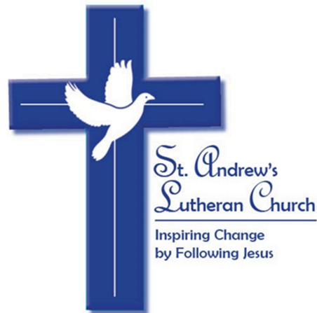
Photo Directory – 67 families/couples sat for photos in early November and 15 others sent in pictures for the 2024 version of St. Andrew's photo directory. Everything has been submitted to the company and you should be receiving your photos any time. The directories will be available in several months. Thank you so much for your participation and we look forward to seeing everyone's smiling faces in the new directory!