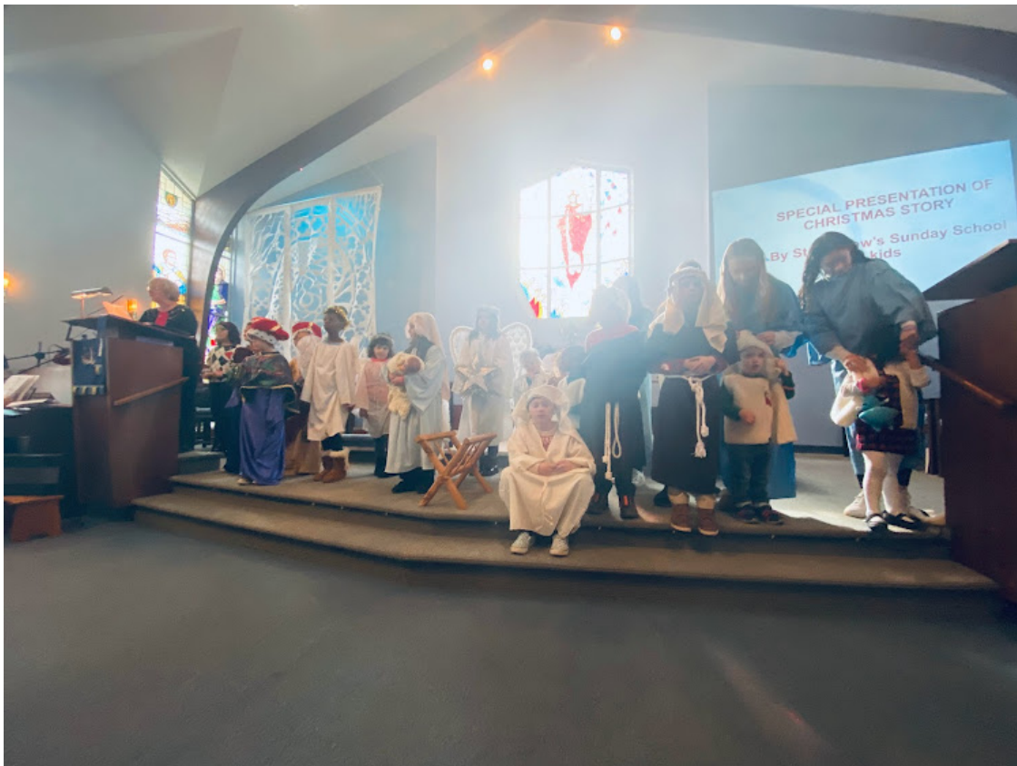
Dec 18 Sunday School Christmas Pageant