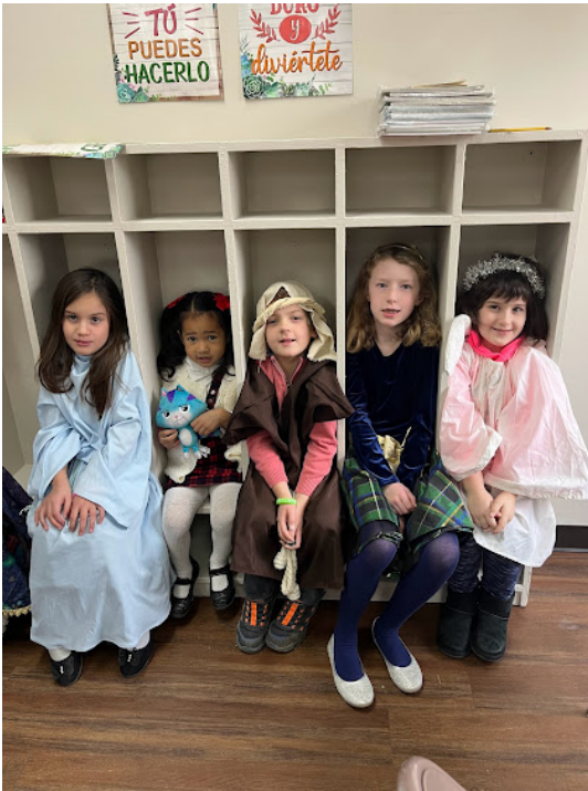
(Right) Sunday School classes participating in the Santa Run sponsored by Yorktown Fire Department. (Left) Children waiting to perform their Christmas pageant.